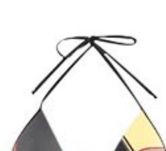
FENDI Maxi F colour-block bikini SHOP NOW >