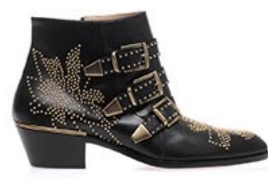
CHLOÉ Susannah studded leather ankle boots SHOP NOW >