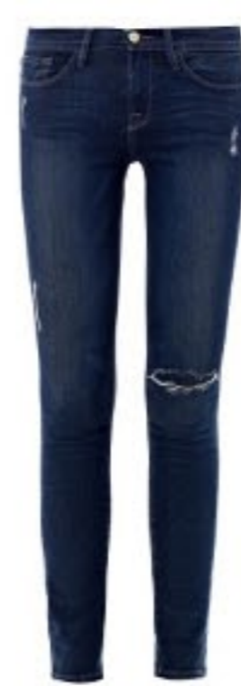
FRAME DENIM Le Skinny de Jeanne mid-rise jeans SHOP NOW >