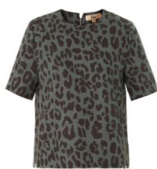
RIKA Ola leopard-print top SHOP NOW >

A Rika tee and skinny jeans by Frame Denim are city essentials – wear with Balenciaga 's classic leather jacket and studded ankle boots for a tough-luxe finish.