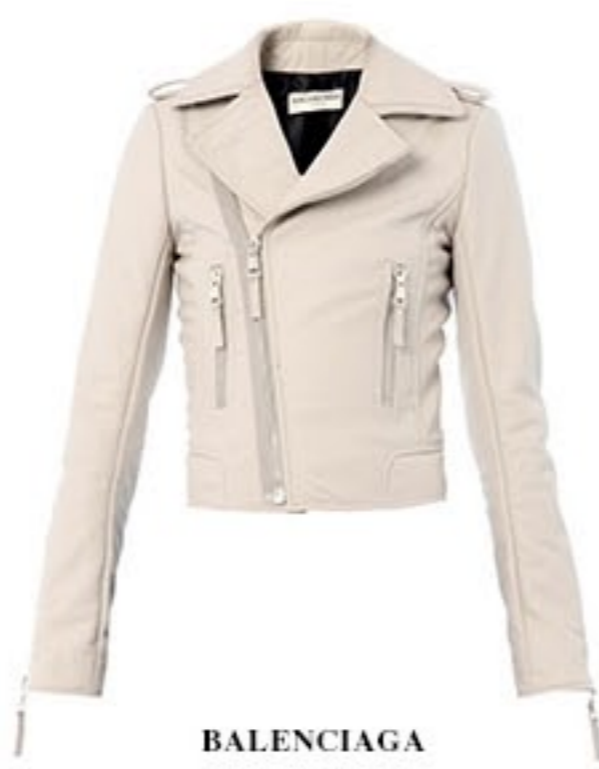
BALENCIAGA Classic leather biker jacket SHOP NOW >