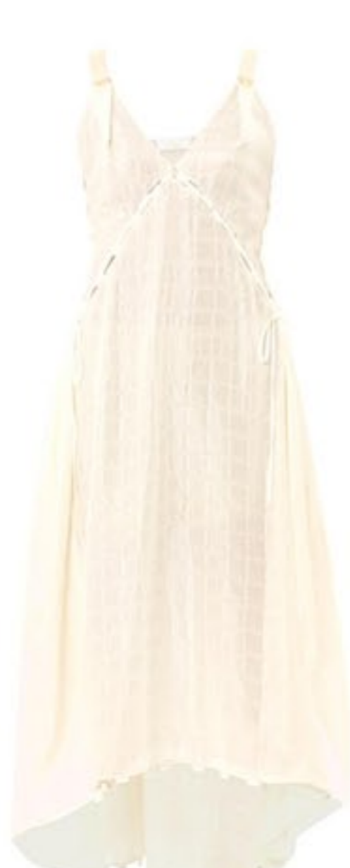
CHLOÉ Silk-cloqué flag dress SHOP NOW >