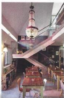
A stylish boutique in the Algarve.